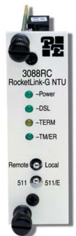
2U-high rack card version available